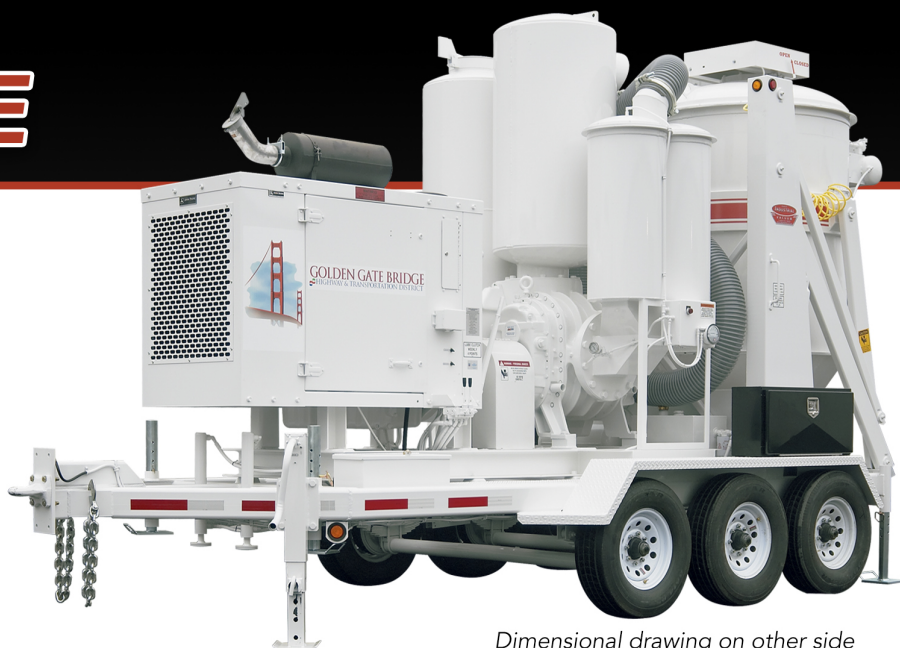
Dimensional drawing on other side