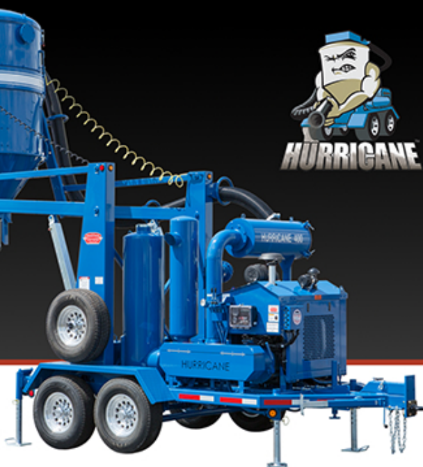
Dimensional drawing on other side