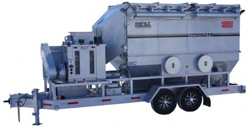
Dimensional drawing on other side