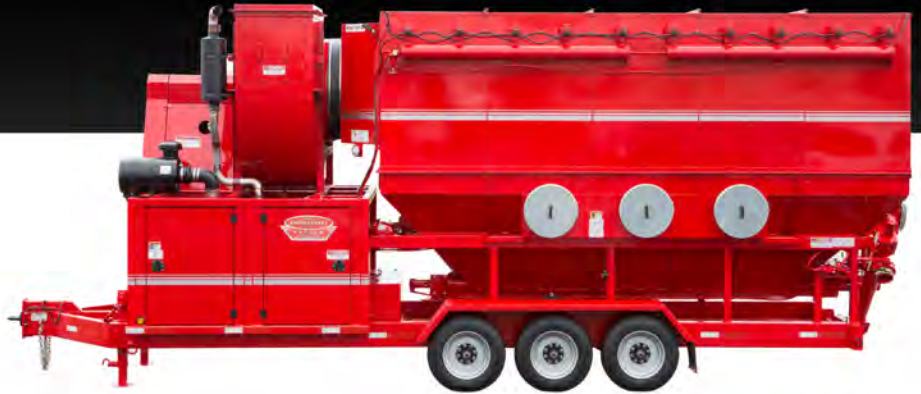
Dimensional drawing on other side

60 side loading easy access vertical filtering cartridges