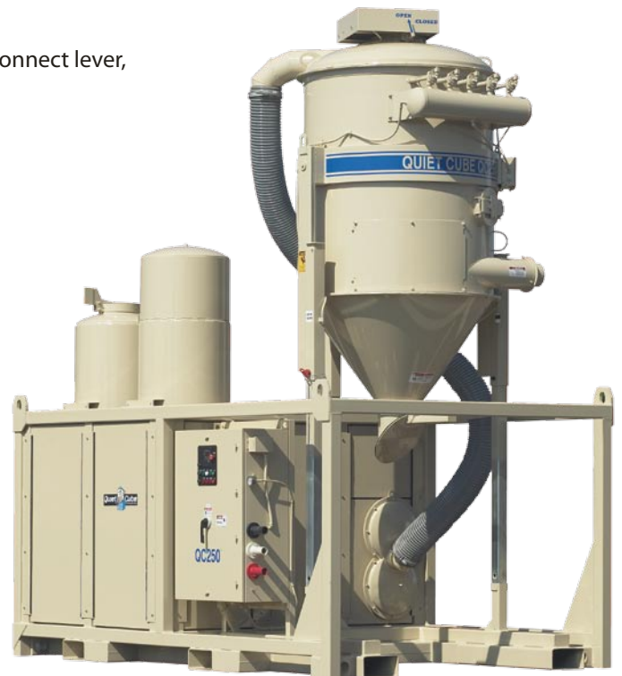
Dimensional Drawing On Reverse Side