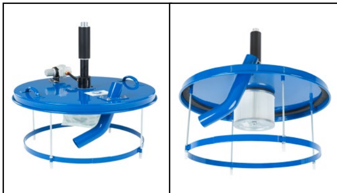
SINGLE-VENTURI VACUUM DT55AP