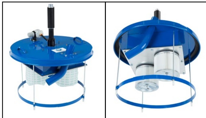
SINGLE-VENTURI VACUUM WITH FINAL HEPA FILTER DT55APH