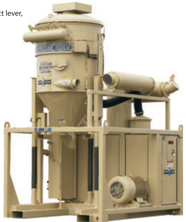
Dimensional Drawing On Reverse Side