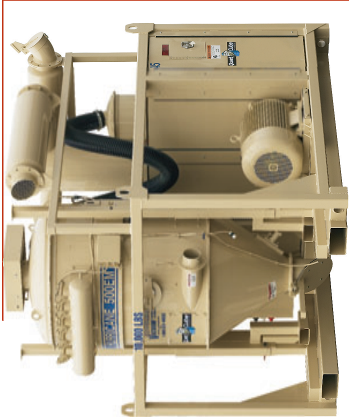
Stowed Height - 126"