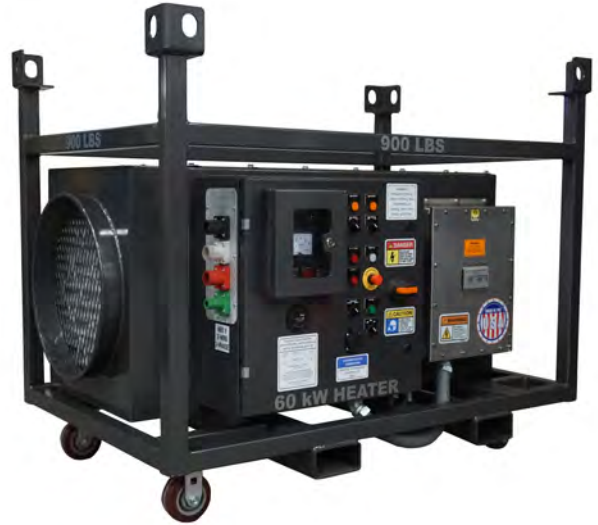
Dimensional drawing on other side

72 amps, 460 Volt, 3 Phase, 60 Hz NEMA 4 enclosure