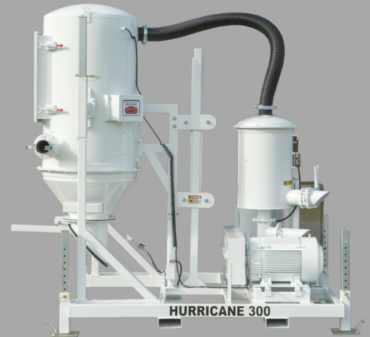
Dimensional drawing on other side