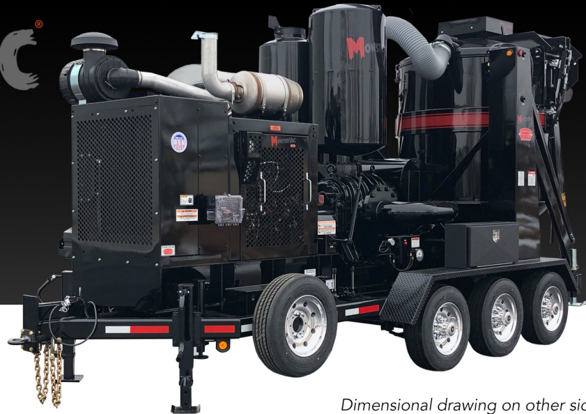
Dimensional drawing on other side