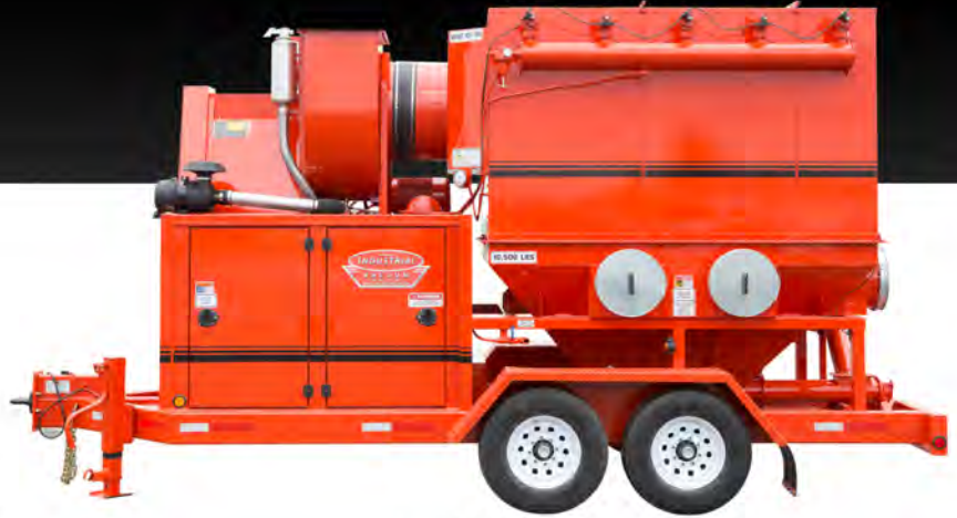
Dimensional drawing on other side